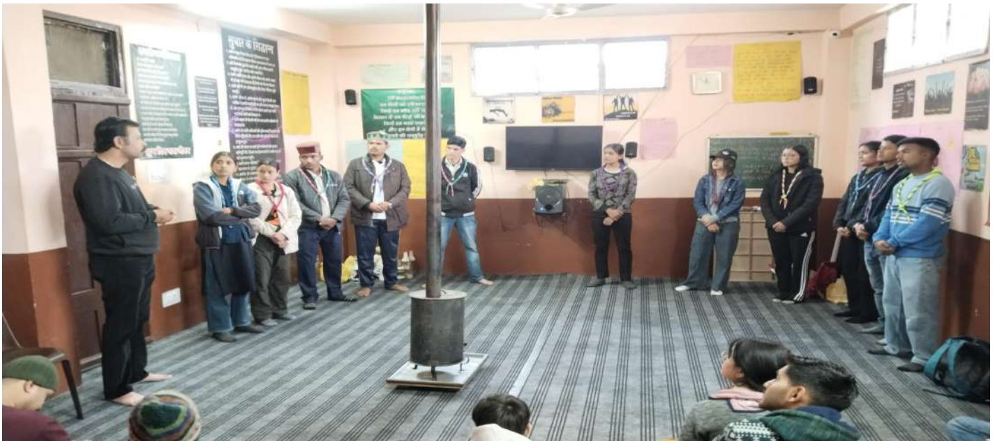
AT "SANKALP REHAB CENTRE"