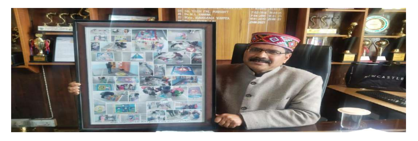
The photo frame of the Rangoli Competition has been put in the principal's office