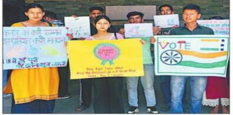
कुल्लू कॉलेज में आयोजित चित्रकला प्रतियोगिता के दौरान विद्यार्थी।

इस अवसर पर महाविद्यालय के विद्यार्थियों ने वोट के महत्व पर चित्रकला और नारा लेखन प्रतियोगिता भी करवाई गई। चित्रकला और नारा लेखन के माध्यम से बच्चों ने 18 वर्ष की आयु पूरे कर चुके युवाओं को मतदाता सूची में नाम दर्ज करवाने, उसका पंजीकरण कैसे करना है और इसके लिए कौन से दस्तावेज आवश्यक होते हैं के बारे में संदेश दिया।